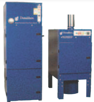
DPF Cleaning Systems